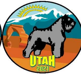
Light Grey Logo