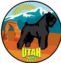
Dark Grey Logo